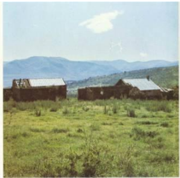
Post Retief in the Winterberg

http://www.egggsa.org/library/main.php?g2_itemId=445378